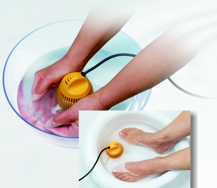
Hand or feet in energy-bath

Acids* 1 need electrons to bind, because they have a lack of electrons (e-).